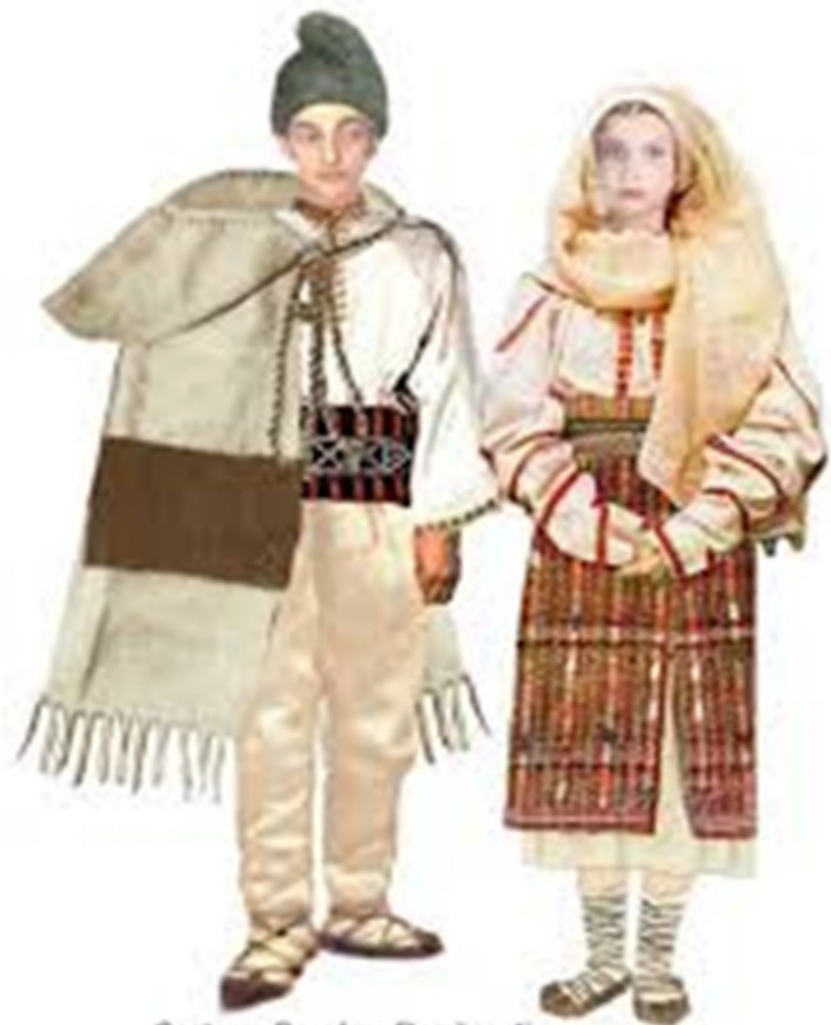
Costume Populare Românești, [91] Regiune: MOLDOVA. Zona: YANCEA