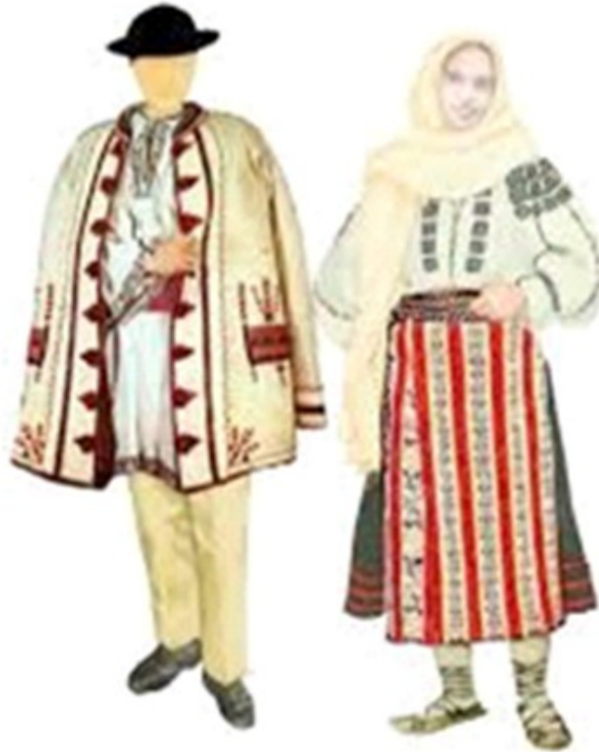
Costume Populare Românesc. [62] Regiune: ȚARA ROMÂNEASCĂ. Zonă: BIRAN (Muntenia)